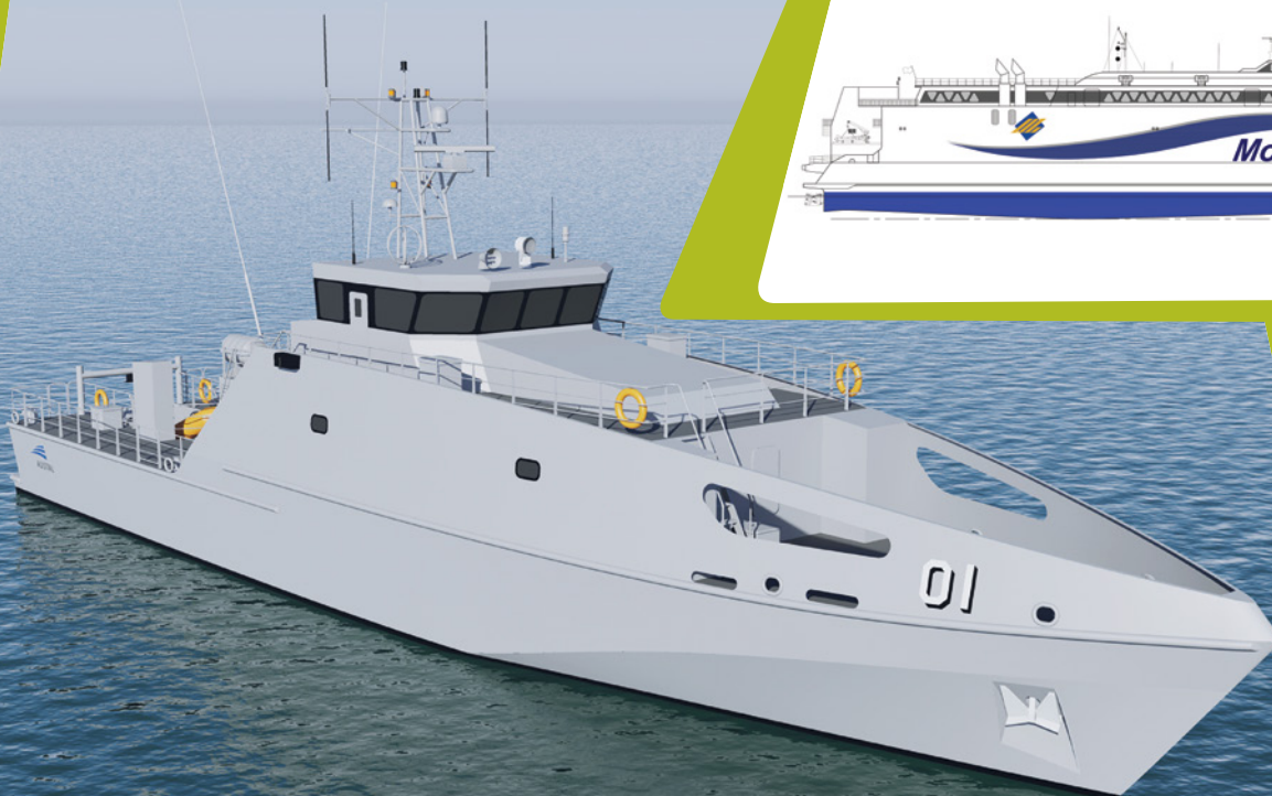
Pacific Patrol Boat design.