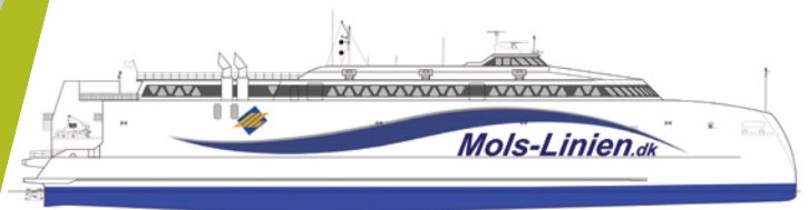
New Mols Linien ferry design.